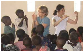
Submitted by: Sister Dorothy Ettling, CCVI, WGC